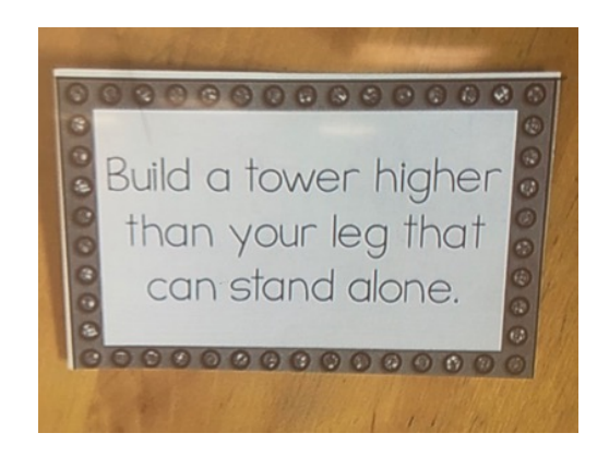
Grade 2/3 students from Division 16 collaborated on this Lego Challenge.