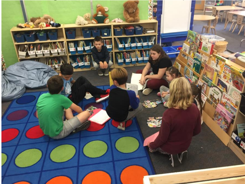
Students working together to communicate their ideas