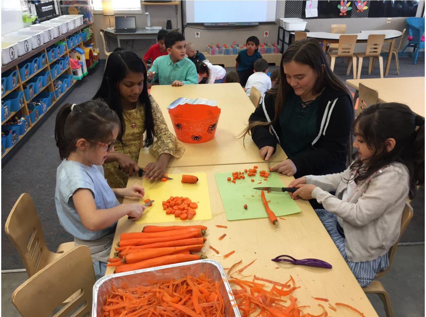
Older students working with and teaching younger students about cooking