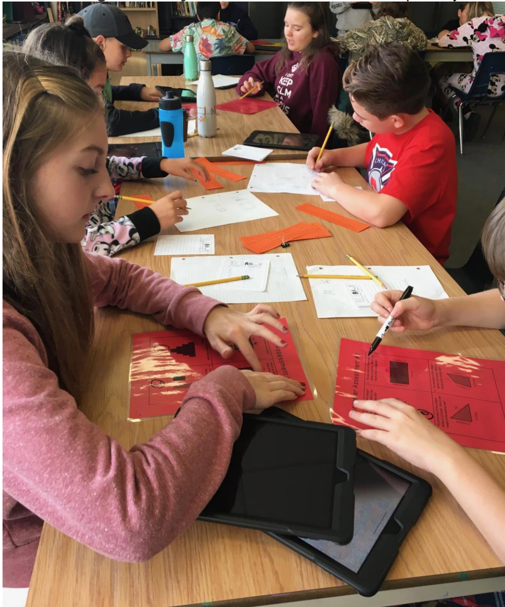
Grade 6/7 students working on a math unit, analyzing and evaluating information.

Coming in January 2018 – Personal & Social Competency.