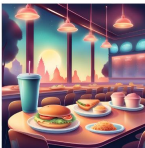
THSS CAFETERIA MENU