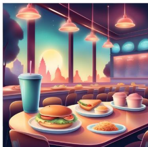
THSS CAFETERIA MENU

Our first grad meeting takes place TODAY at 10:00 am in the rotunda