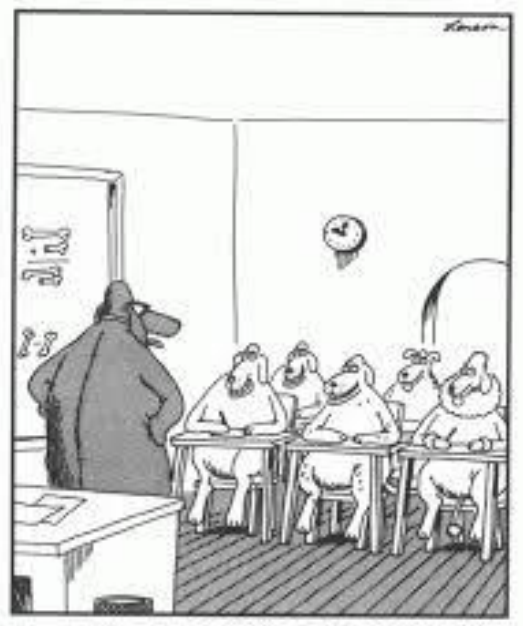
"Well, here we go again. ... Did anyone here not eat his or her homework on the way to school?"