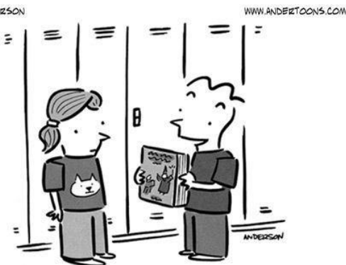
"You would not believe the battery life on this thing. I've been reading it for weeks!"