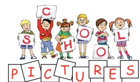
Photo Expressions will be taking student photos on Monday, September 20, 2021.