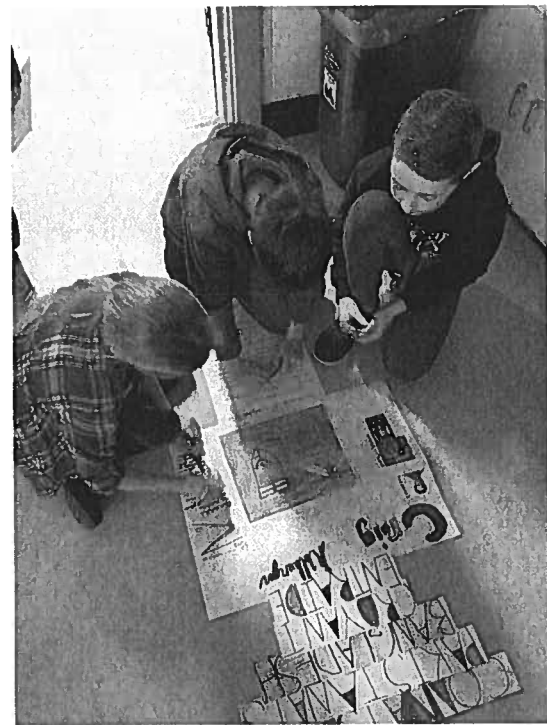
Comments by these grade 4/5 students reveal how they value each other's strengths and learn from one another as they work collaboratively on their biography project

Coming in March – Aboriginal Worldviews & Perspectives in the Classroom.