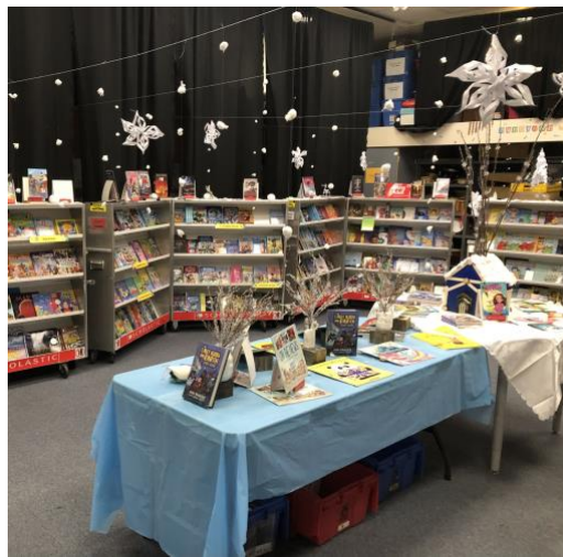
MRE Book Fair 2022 The stage was transformed into a Winter Wonderland.

Did you know that all MRE parents are automatically members of the PAC? If you would like to learn about how to become more involved, please check the PAC section further on in this newsletter. Parental involvement is important to the success of any school.