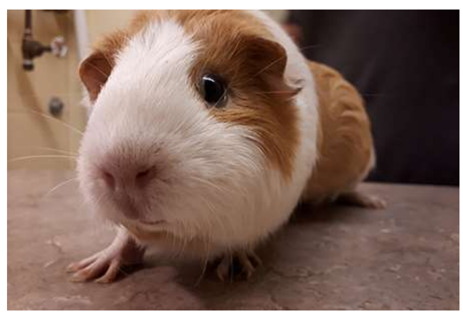
Meet Skylar at the BC SPCA Maple Ridge Open House!