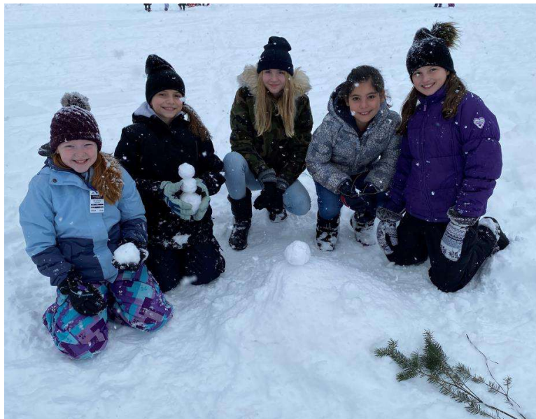
Building relationships in the snow