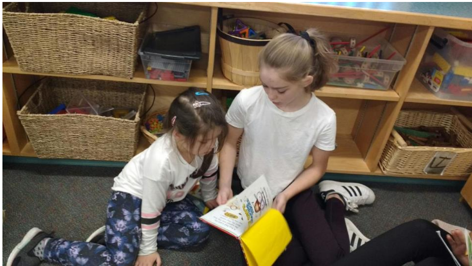
Formative Assessment can come from many places.