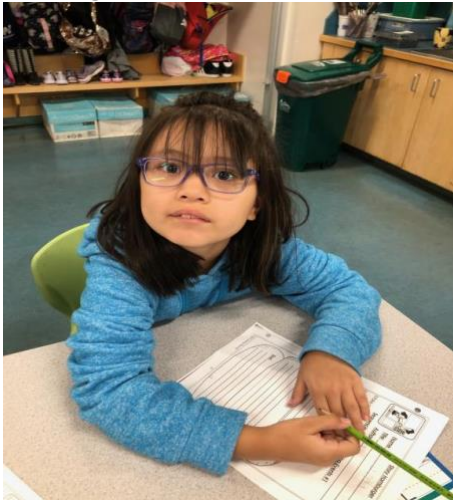
Awareness of our connection and belonging to a place.