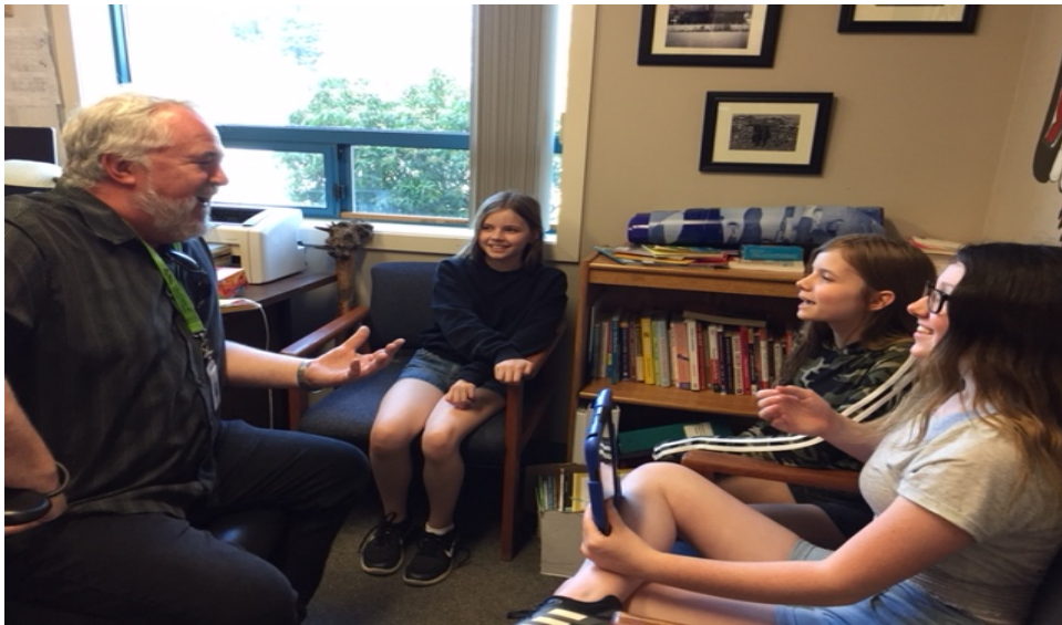
Students Inquiring about the evolution of school expectations and policies with the Principal

Coming in June – How Do We Assess and Celebrate Learning?