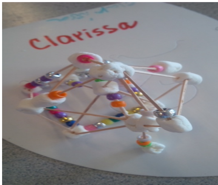
Grade 3 students inquiring about structure strength and form