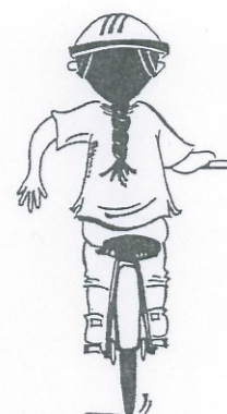
Stopping or Slowing