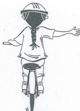
Alternate Right turn